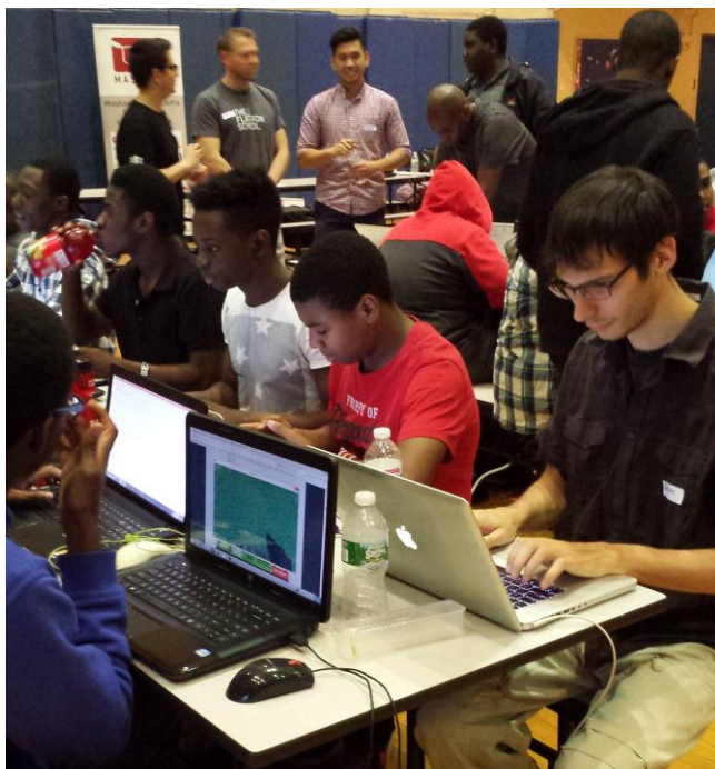
P-TECH students collaborate with volunteers from local tech companies at our first annual Hackathon (May 23, 2014)

“Watching interns develop, even over a short time, was extremely rewarding...they brought perspectives to our work that we never would have thought of.”